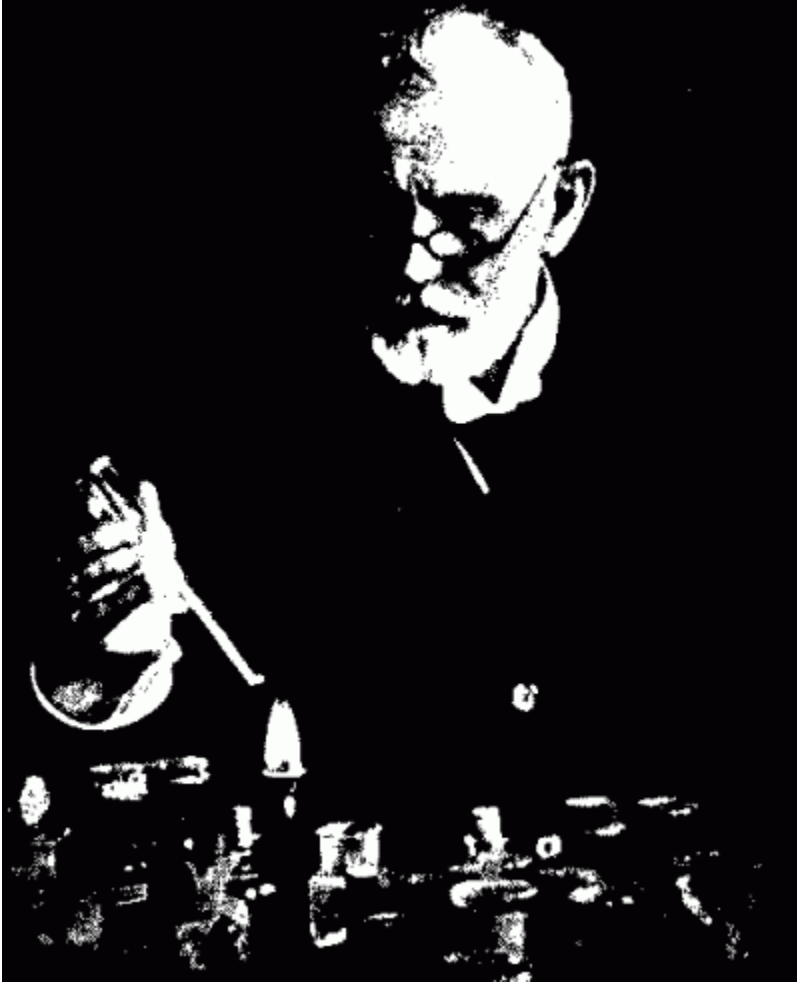
Paul Ehrlich [1854-1915]

(From "Year Book of Skin and Venereal Diseases," 1916, vol. ix. "Practical Medicine Series," Year Book Publishers, Chicago.)